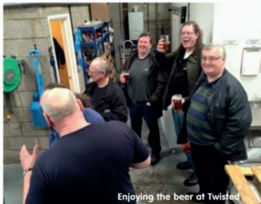
Enjoying the beer at Twisted