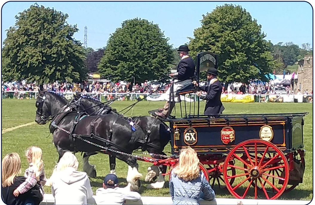
Wadworth Shire Horses at Bath & West Show in 2023

With hope to raise money for a bronze sculpture, plinth and background mural to surround the statue, as well as a plaque to explain the significance of the horses to future generations they have contacted Wadworth, and Backhouse, the property developer behind plans to develop the old brewery site into residential housing, with both giving their blessing to the project.