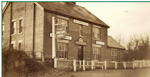
The Junction Inn, Circa 1910

Stroud Brewery as the owner. The abundant fruit in the area would have been distributed country wide utilising the rail network which gives The Junction its name.