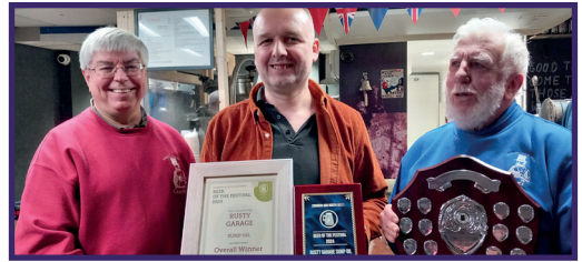
Rusty Garage presentation (31 Jan 2025)

Everyone who attends the festival is encouraged to vote for their beer and cider of the festival. Local breweries did very well in the voting with Rodbourne based Rusty Garage coming first for Sump Oil.